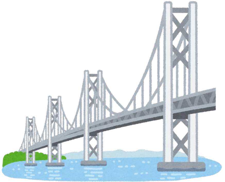
Seto Inland Sea