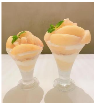
Fruits Parfait 🍓 🍇